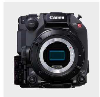
EOS C300 Mk III