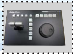
Instant Replay Control