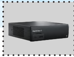
4 Channel Multi-viewer