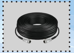
All necessary cables