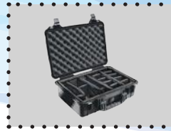
Foam Set Included