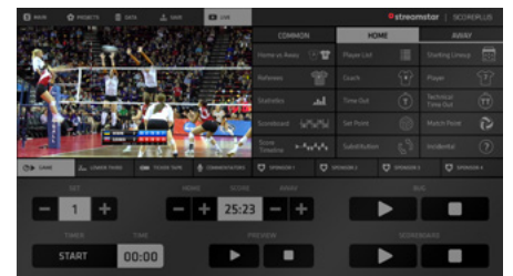
Volleyball game control interface