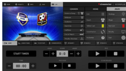
Football / Soccer game control interface